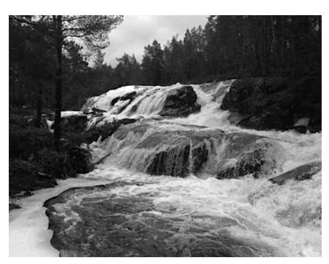
Fig. 8 – The Bøla reindeer in 1907 when the waterfall still ran naturally. Today the waterfall is blocked by a concrete wall. (Photo: Gustaf Hallström from Norberg, 2020, p. 161).