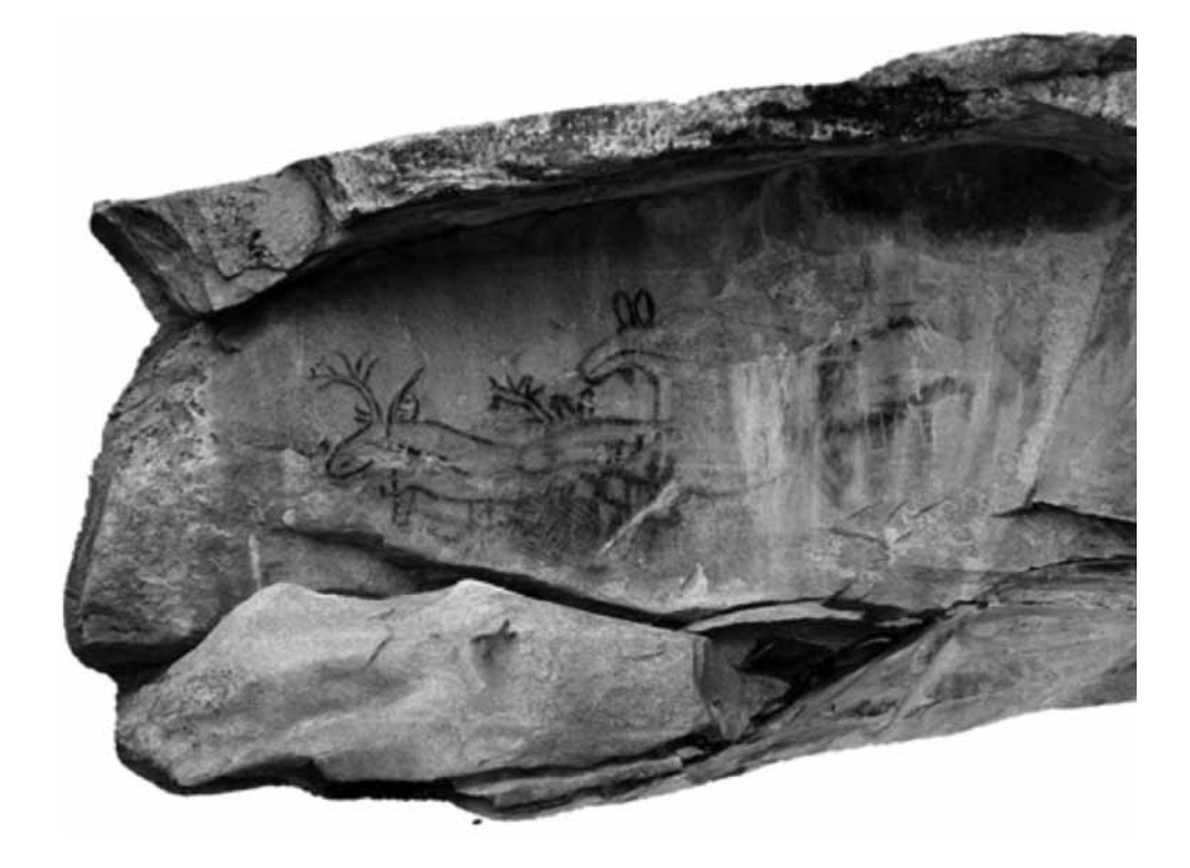
Fig. 6 – Honnhammer I is underneath an overhang, creating something like a doorway in the rock. The zoomorphic formation is difficult to discern just under the painted deer to left.