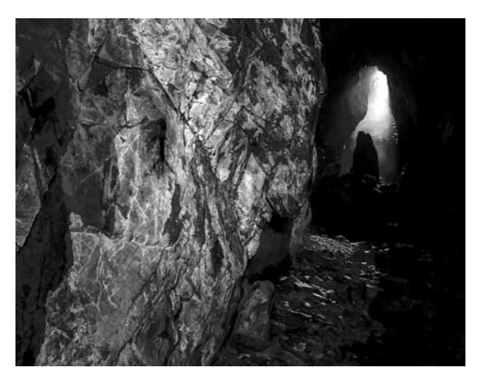
Fig. 2 – From the grave chamber at Rishaug.