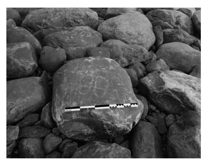
Fig. 7 – Imprints of feet emerged along the shore of Selbustrand in the spring.