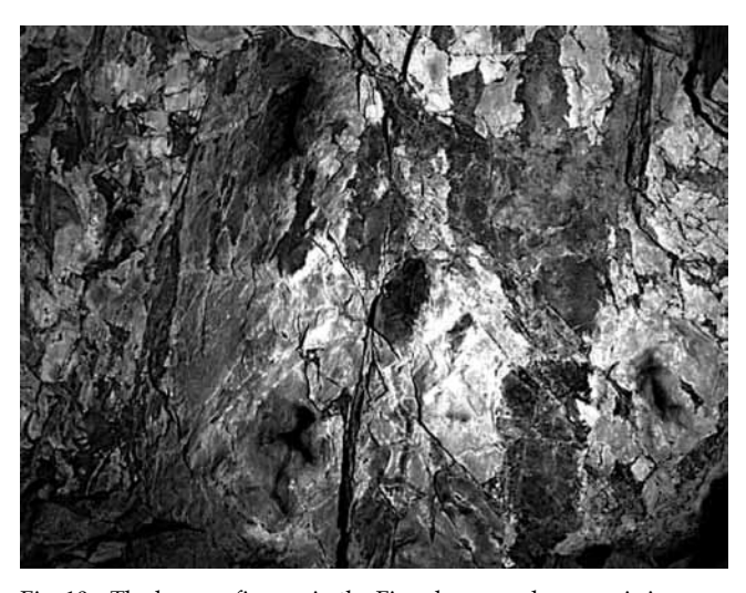
Fig. 10 – The human figures in the Fingal cave make an eerie impression. (Photo: Arve Kjersheim from Norsted, 2008, p. 29).