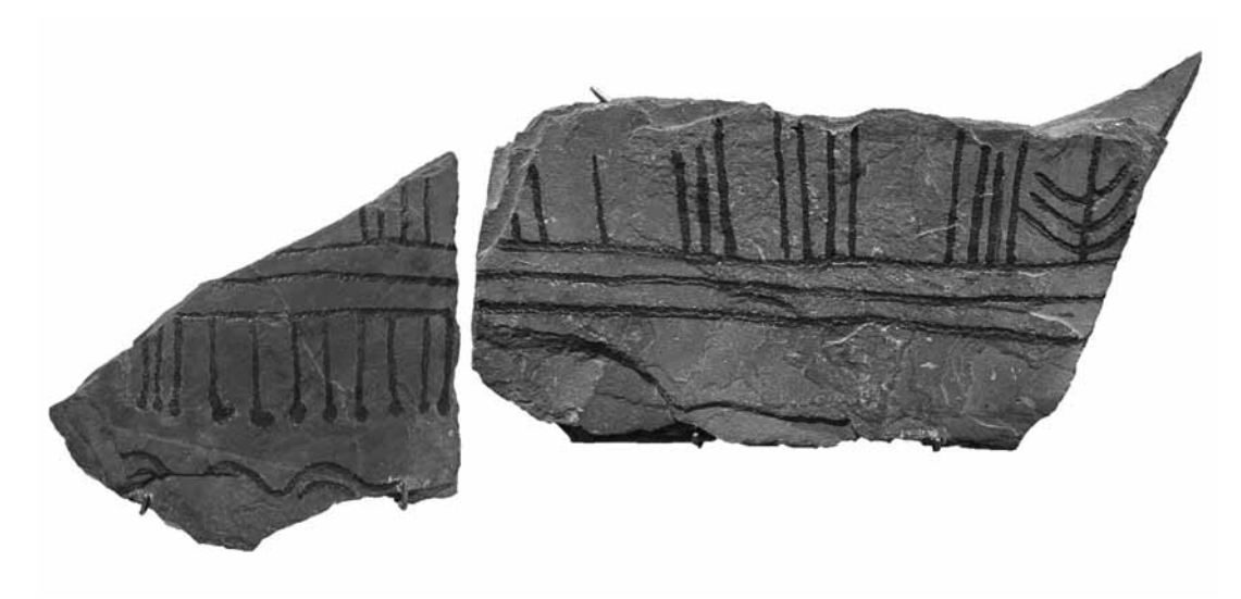
Fig. 1 - The remainders of the grave chamber at Steine. (Photo: Ane Aasmundstad Sommervold).

2002 Ristninger og graver i landskapet, in J. Goldhahn (ed.), Bilder av bronsålder - ett seminarium om förhistorisk kommunikation, Stockholm, Almqvist & Wiksell International, pp. 185-199.