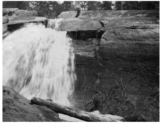
Fig. 9 – The Bøla site flooded, emitting tremendous noise and danger. (Photo: Odd Bratberg).